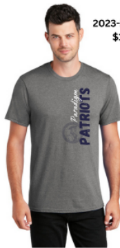
2023-24 T-Shirt $10.00