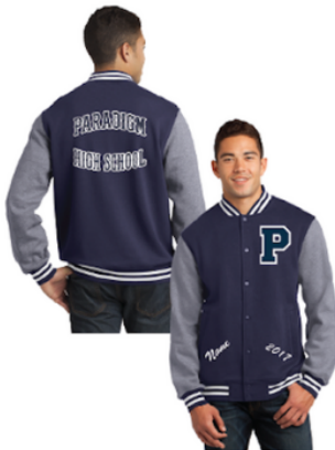
Paradigm Letterman Jacket $95-120